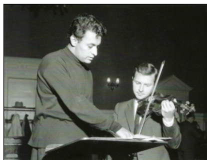
Zubin Mehta and Arve Tellefsen