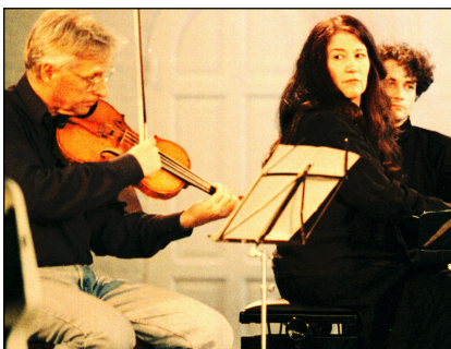
Arve Tellefsen and Martha Algerich