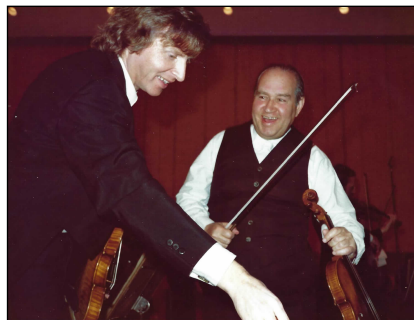
Arve Tellefsen and David Oistrakh