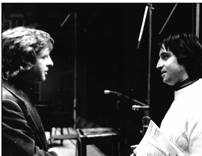
Arve Tellefsen and Riccardo Muti